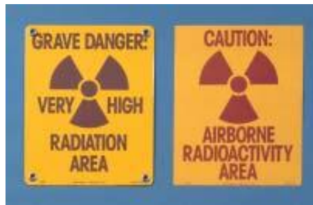
Cardboard (Model 09-567) and steel (Model 09-667)

Fluke Biomedical has a wide selection of warning signs, labels, tags, and tapes that follow the NRC and Agreement States recommended wording, symbols, size, and colors for such products.